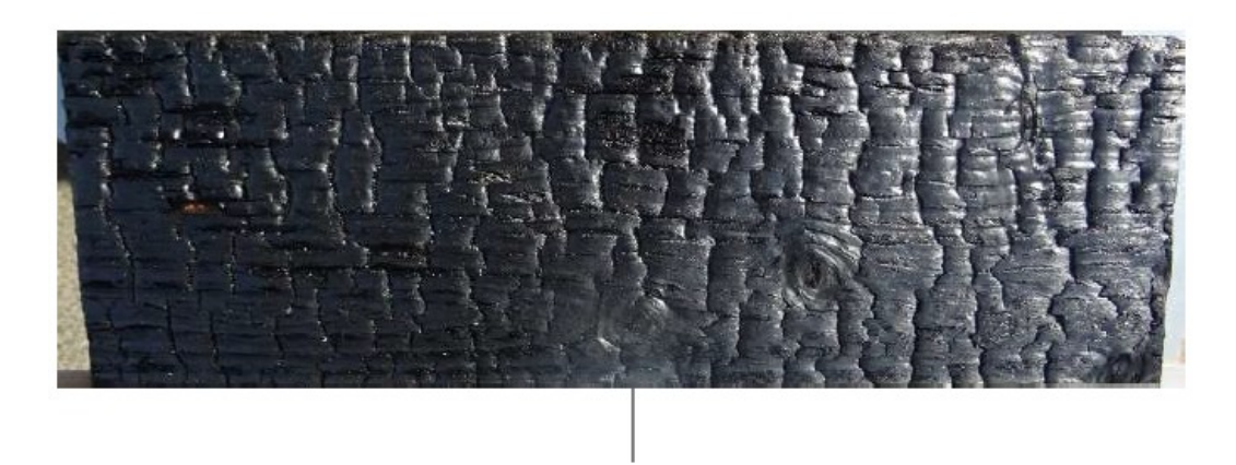
7 months exposure (without protection)