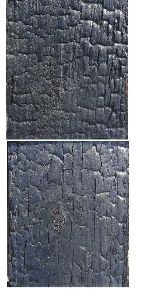
Initial state (with protection)